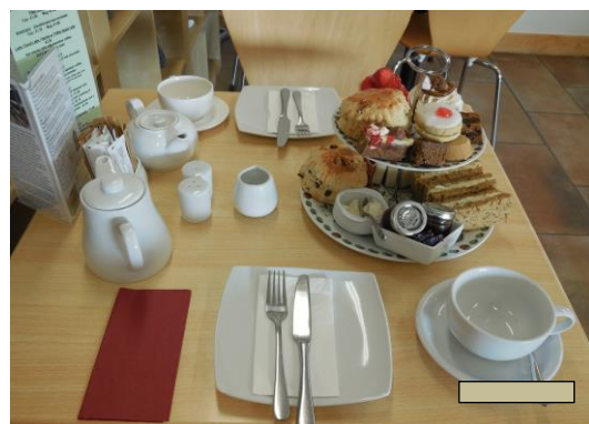
selection and layout may vary and the image is for illustration purposes only

£1 each surcharge applies for Latte, Cappuccino & Hot Chocolate etc