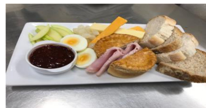
Selection and layout may vary and the image is for illustration purposes only

Selection of hand raised pork pie, honey roast ham, cheese, homemade onion and onion and cranberry marmalade, apple, pickles, boiled egg and farmhouse bread